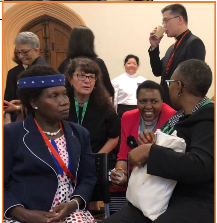
Women networking about IAWN representation

fully participate in all of life and ministry.