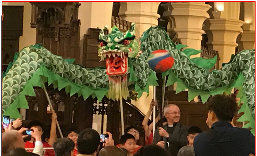
Celebrations with Dragons at the final service at Holy Trinity Cathedral Hong Kong

Chair IAWN Steering Group; Archdeacon of Auckland