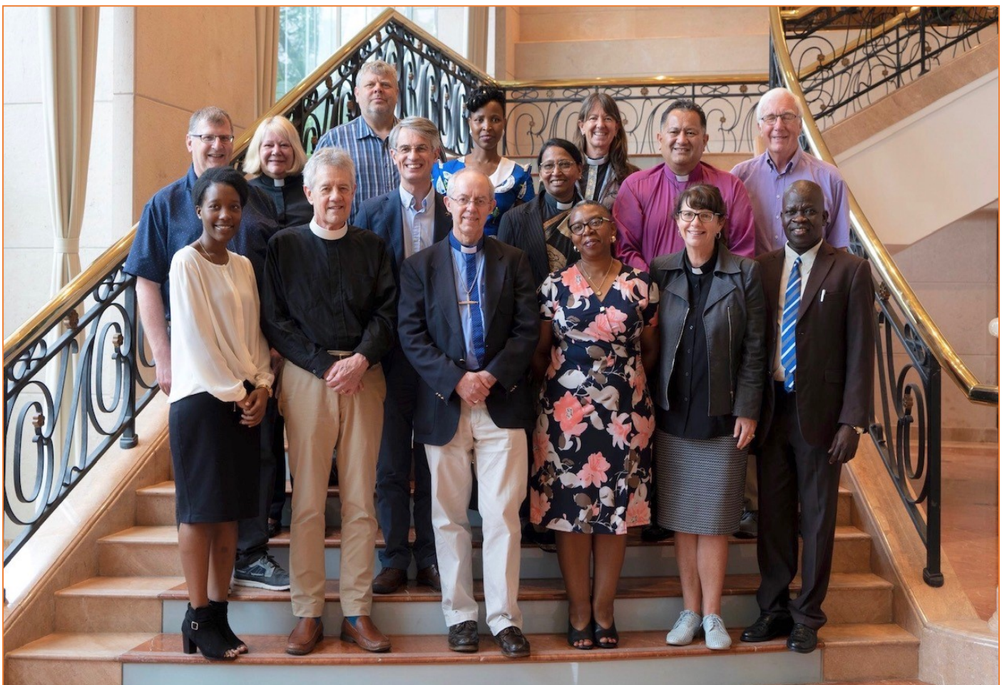
The official photo of the network reps with the Archbishop of Canterbury